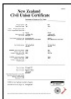
Civil union certificate